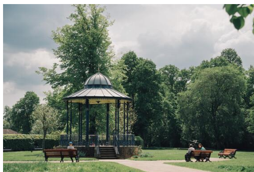
War Memorial Park, Romsey

For another year in a row, three parks in Test Valley have been awarded Green Flag status. Rooksbury Mill Local Nature Reserve in Andover, Valley Park Woodlands Local Nature Reserve and War Memorial Park in Romsey have all been recognised by Keep Britain Tidy and given the international quality mark for parks and green spaces.